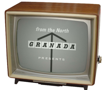
The Beatles first time on TV

and hysteria of what they were achieving in their Liverpool home finally reached Manchester 30 miles away. Granada TV dispatched a crew to capture the excitement. Co-incidentally Ringo had just replaced Pete Best and a section of the audience were shouting "We want Pete!" Beatleweek officially begins this Wednesday and the fans this time will be chanting "we want to meet!" Hopefully with the pandemic under control we can all get back together to celebrate the world's undisputed greatest ever band.