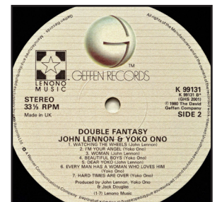
Double Fantasy Album