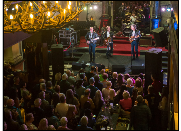
Alma de Cuba

A warm Welcome Back to Liverpool at Alma De Cuba. The entertainment will be a mix of Liverpool and International artists. The outdoor patio stage