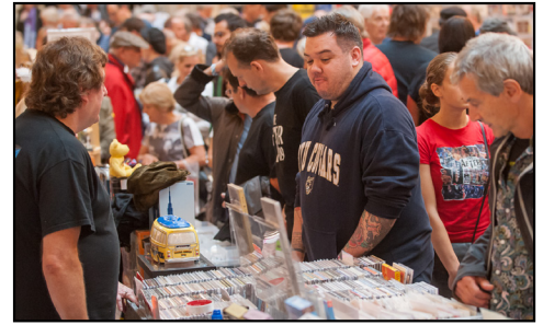
Sunday Convention at The Adelphi Hotel

Convention Day! Established over fifty years ago it is the biggest and best Beatles Day in the world. The Beatles are 'Here, There and Everywhere'! An