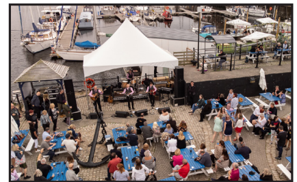
The Yacht Club

After the success of last years riverside gig at The Yacht Club , we have decided to return again, but with one huge improvement. On day 6 of Beatleweek a lot of our 'oldies but goldies' struggled with the half an hour walk