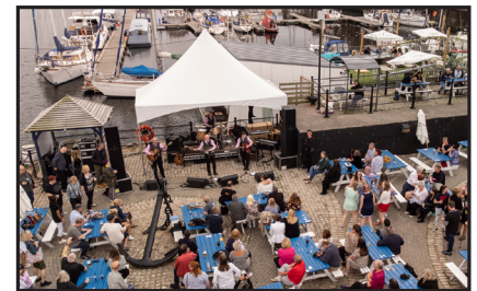
The Yacht Club

to the marina (albeit along the beautiful River Mersey). So this year we will provide a Magical Mystery Tour shuttle bus. The theme of the event is ' B side to Riverside ' (a nod to Linda!). The main stage will feature bands playing songs that were only B sides to the singles of The Beatles and John, Paul, George and Ringo's solo years. You will be amazed at how many instantly